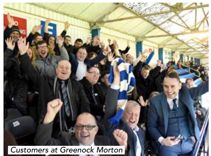
Customers at Greenock Morton