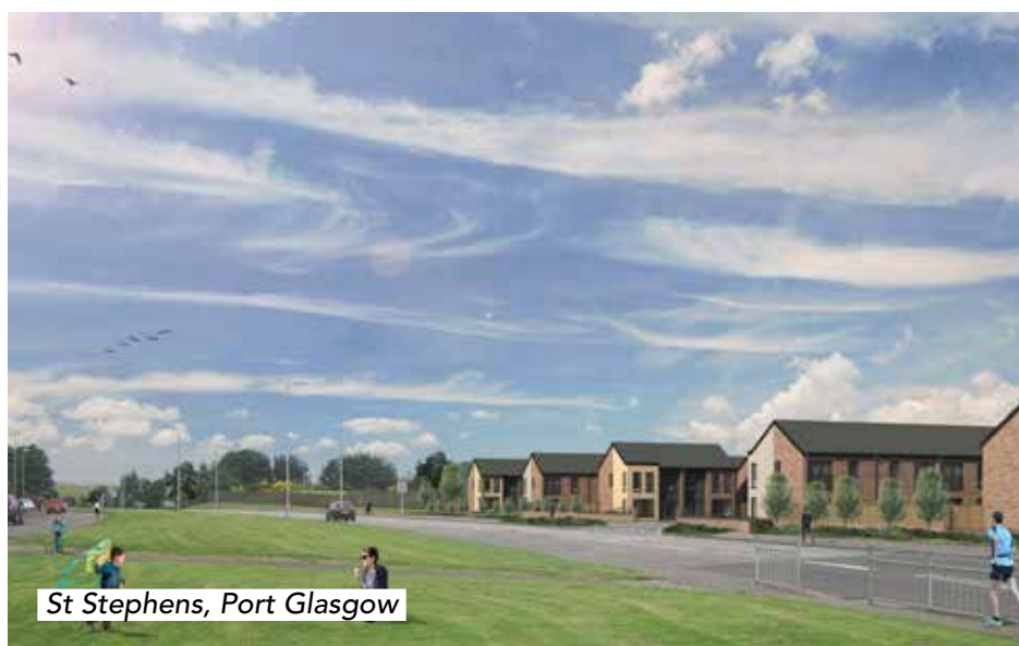
St Stephens, Port Glasgow

In 2018 we have handed over new homes at Bay Street (41 units) and Slaemuir in Port Glasgow (28 units) and another 20 homes are due soon in the Mallard Bowl area.