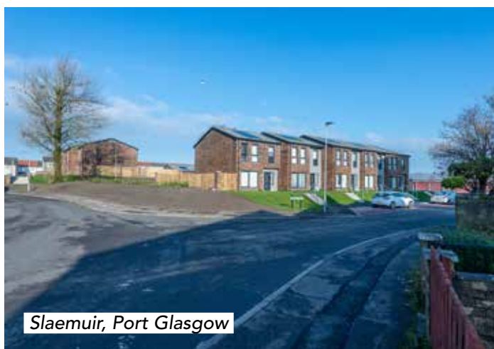
Slaemuir, Port Glasgow