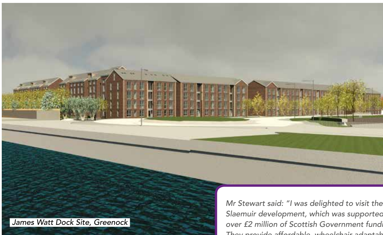
James Watt Dock Site, Greenock