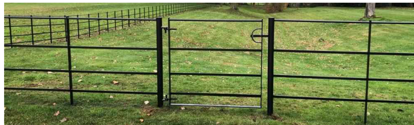
Proposed estate fence and associated gate